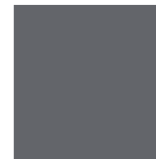
Pantone Cool Gray 10