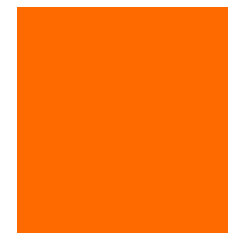
Pantone 1505 C